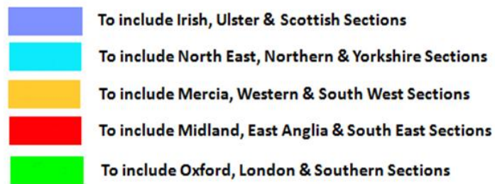
Diagram 1 - Example of the Regional Boundaries and Associated Sections